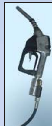
Connected to Petrol dispensing nozzle