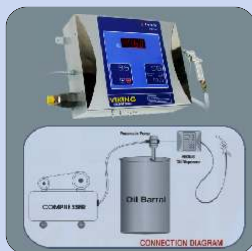
Also available Barrel Dispensers