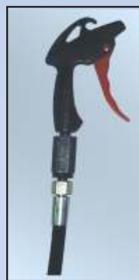
Direct dispensing Nozzle